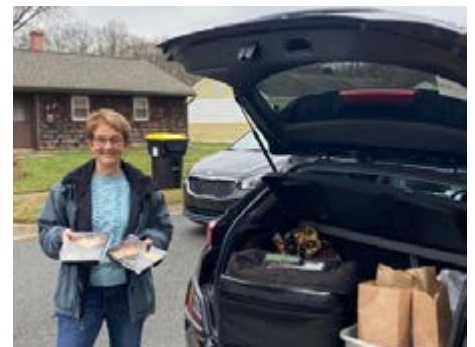
Meals from Newark Senior Center