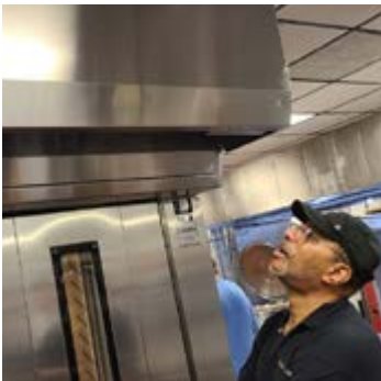
Ovenhood at Modern Maturity Center